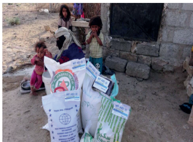
Food distribution to displaced families in Sana'a