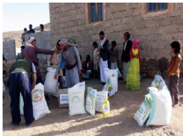
Families collecting their food baskets