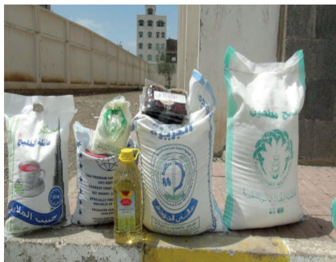
Some of the food basket contents