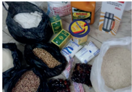
AFRICAN FOOD PACK

We also made sure that each individual pack was filled with food that is tailored to the tastes and flavours of local diets.