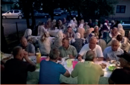
A community Iftar in Bosnia