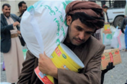
A beneficiary receiving a Food Pack in Yemen

Millions of people, including displaced Syrian refugees, living across the Middle Eastern countries like Lebanon and Iraq bear the grave consequences of war and conflict. They are gripped by hunger, poverty and displacement whilst struggling to survive with the little help they receive from the outside world.