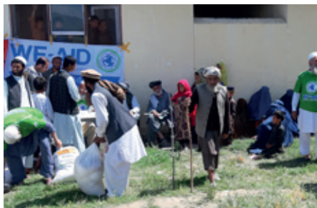
Food Pack distribution in Afghanistan

With your help, WF-AID has been able to provide for 494,571 people living in poverty across Asia through our distribution of nutritious Food Packs. This included supporting Rohingya refugees as well families within our own communities in India and Pakistan.