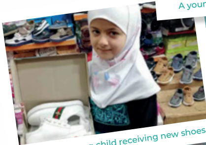
Another young child receiving new shoes