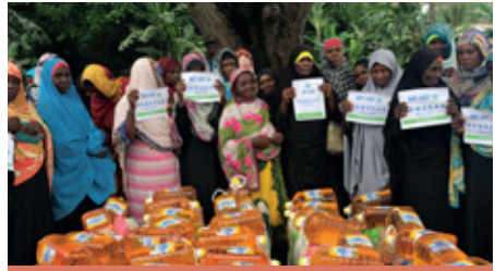
Women receiving Food Packs in Tanzania

The critical hunger crisis across Africa has left around 233 million people hungry or undernourished.