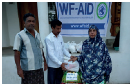
A widow receiving a Food Pack in India

It is reported that there are 520 million people who are suffering from hunger across countries in Asia. 70% of all malnourished children in the world live in Asia, particularly in countries like India and Bangladesh.