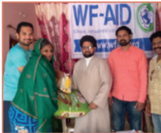
Distribution in India

MEALS WERE FACILITATED FOR PEOPLE IN NEED