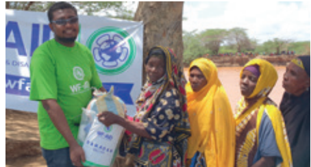
Beneficiaries receiving Food Packs in Kenya

WF-AID distributed relief in the form of Food Packs, which helped 45,634 people across Tanzania, Kenya and South Africa.