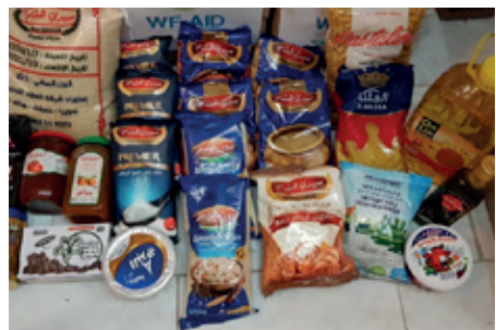
MIDDLE EASTERN FOOD PACK