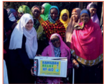
Distribution in Kenya