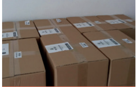
Food Packs ready for distribution in Bosnia

Through your donations, WF-AID has supported 66,362 people living in Bosnia, Kosovo, Myanmar, Trinidad & Tobago, Thailand, Philippines, Chile, Myanmar, Italy, Nepal and the UK.