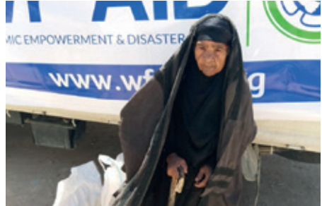
Food Pack distribution in Iraq

Thanks to your donations to our Ramadan Relief Appeal, we've helped over 47,965 people across the Middle East.